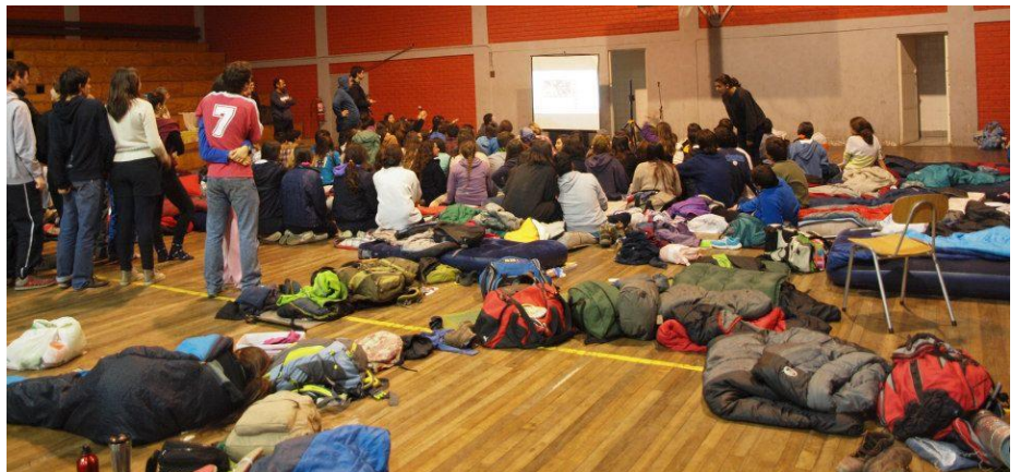
Georgians participating in Trabajos de Invierno sleep on the floor of a gym.